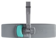
Pockety Infinity frame