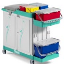
Magic System 720E