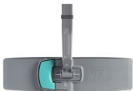
Pockety Infinity frame